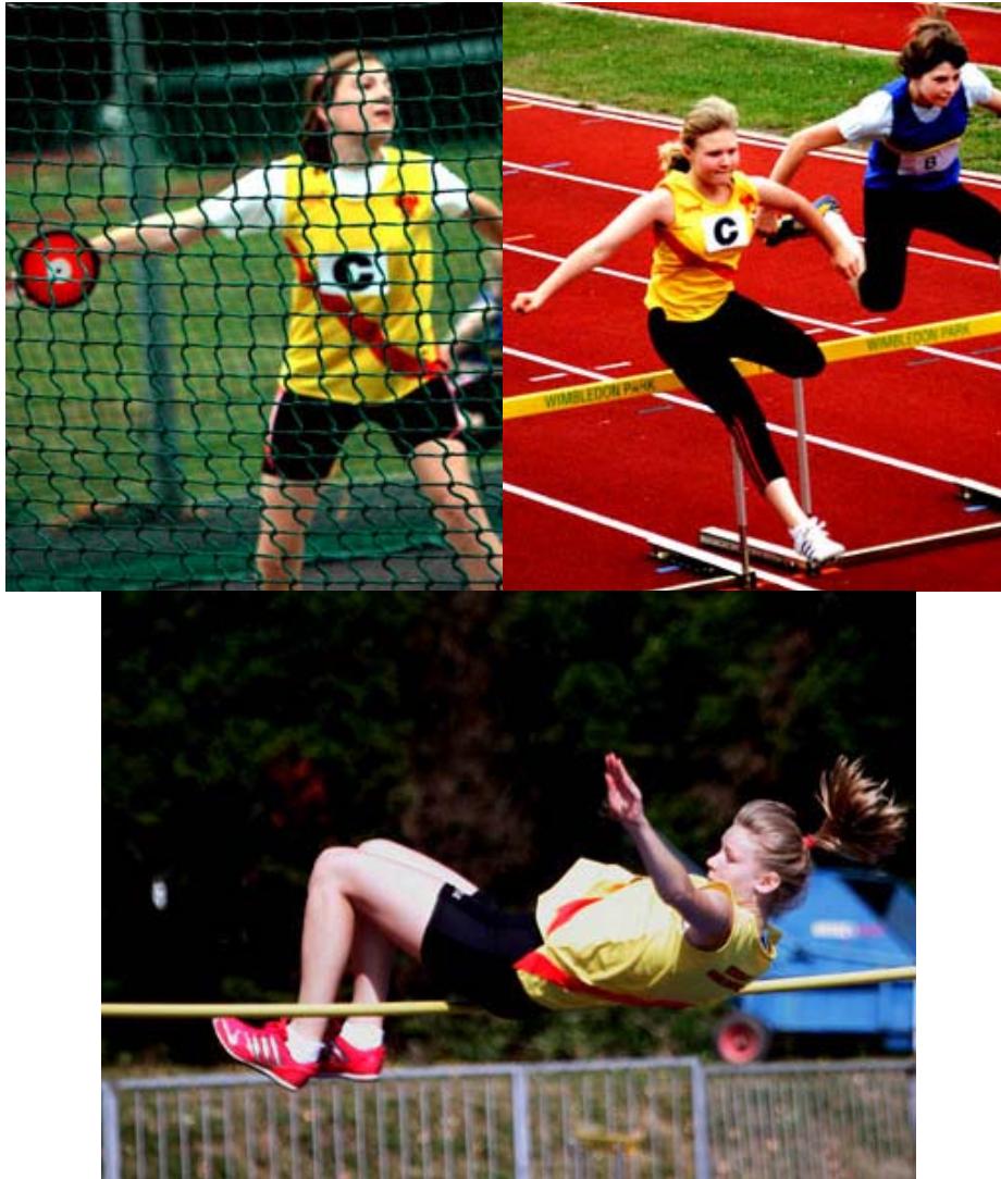
The ladies of HW enjoying their day in the sun at the Southern Women's League