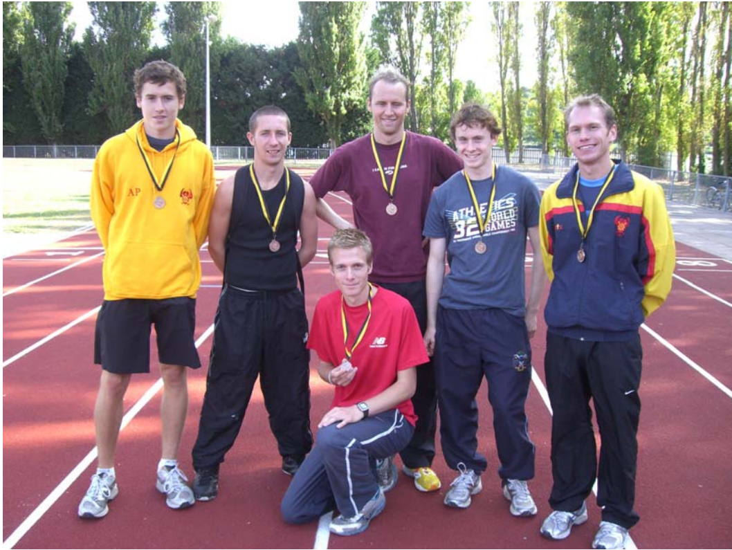
(1) The HW Senior Men's team proudly display their bronze Surrey Championship medals