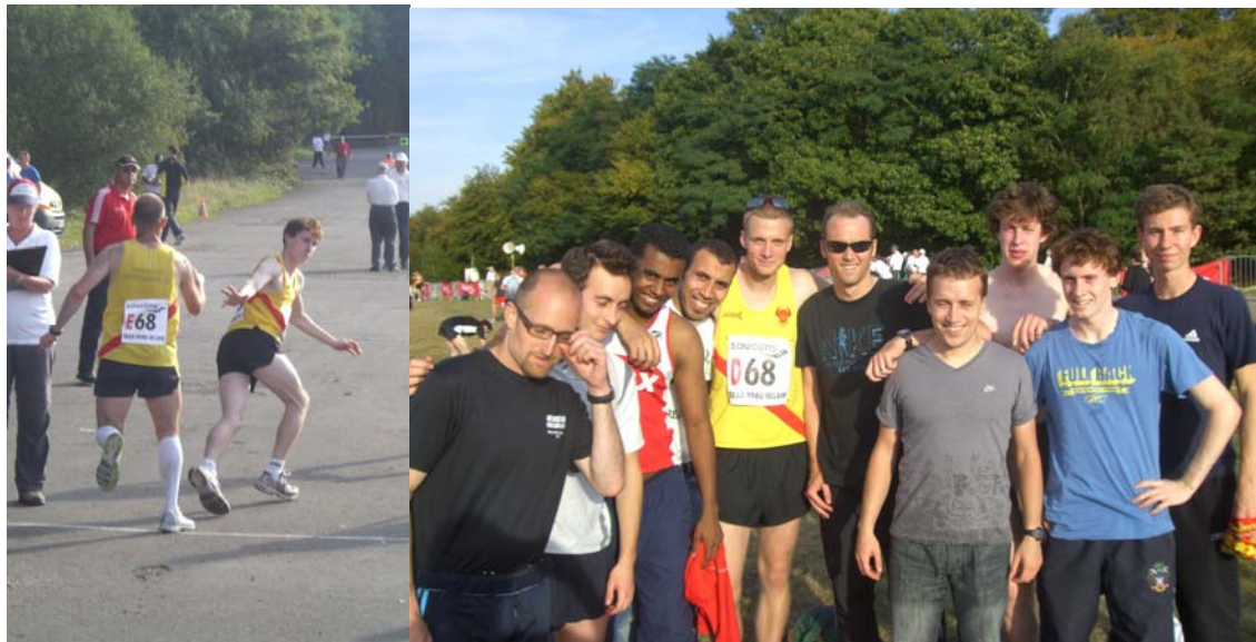
A day at the Aldershot Relays

Full results available here: http://www.afd.org.uk/general/relays8.htm