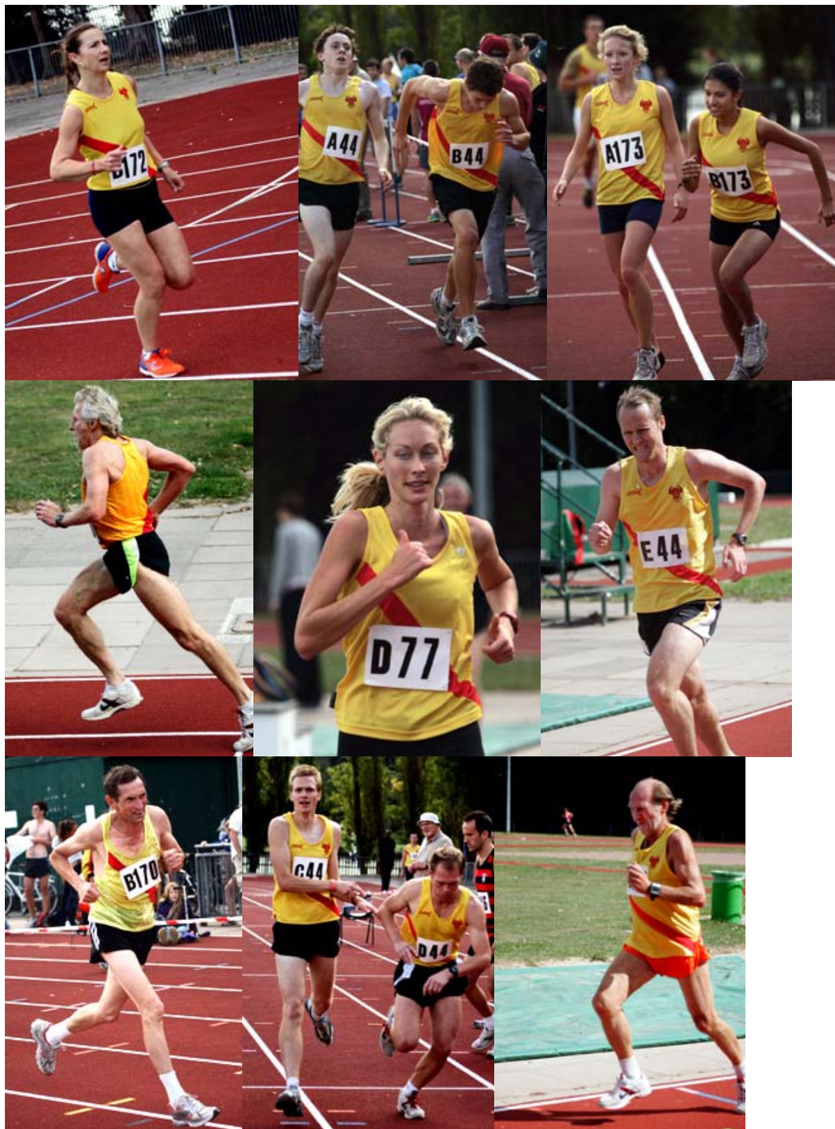
Some action at the Surrey Road Relays