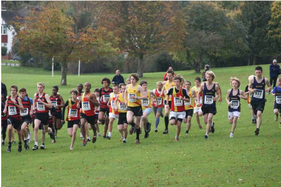
The East Surrey League Young Athletes race gets under way