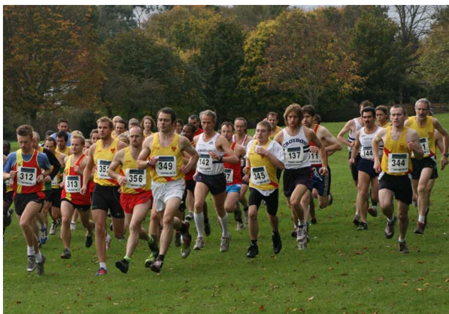
The start of the Senior East Surrey League at Lloyd Park

TEAM (3-to-score): 1 Hercules Wimbledon 8; 2 Epsom & Ewell H 19; 3 Croydon H 32 ... 5 Hercules Wimbledon 'B' 46